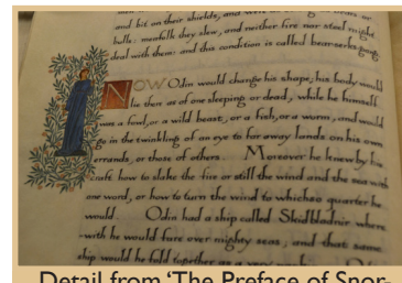
Detail from 'The Preface of Snorris Sturluson' from the Icelandic elmskringla', translated by William